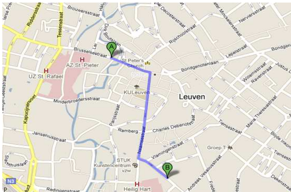
Map 2: From the Hotel Ibis to the Seminar Room

From the railway station, you can reach Hotel Ibis by a twenty minute walk. Turn into the street in front of the Railway station (Bondgenotenlaan). Then, cross the Great Market square between the old town council and St. Peter's Church. Now, enter Brusselsestraat. You will find Hotel Ibis to the right, after some 250 meters (number 52). You can also reach the hotel by bus. Take line 335 Aarschot Leuven at the railway station and alight at the bus stop Dirk Boutslaan. Cross the street and turn into Franz Tielemanstraat. Subsequently turn right into Brusselsestraat. You will find Hotel Ibis to the right